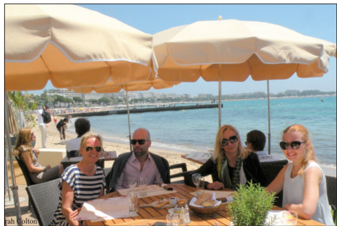
Sampling the Duval-LeRoy Champagne at The Terrace Garden restaurant of The Palace Hotel Le Royal Monceau-Raffles in Paris.

Each Spa My Blend by Clarins is unique and integrates the qualities of its host hotel and city. As Dr. Courtin-Clarins said, "Just as the Spa My Blend by Clarins at The Majestic Barrière Hotel reflects the glamorous atmosphere of Cannes and the French Riviera, the hotel for each Spa My Blend by Clarins is selected to provide the highest ideals of local color, luxury, and comfort. The Spa My Blend by Clarins in Paris embodies the elegant and urbane values of The Palace Hotel le Royal Monceau-Raffles, Paris."