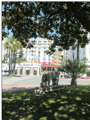
View of the legendary Hotel Majestic Barrière in Cannes from the Croisette.

For its Spa My Blend by Clarins on the French Riviera, Dr. Courtin-Clarins chose the legendary Hotel Majestic Barrière which dominates Cannes’ Croisette with its exceptional atmosphere and decoration. “Facing the famous steps of the Palais des Festival [location of the