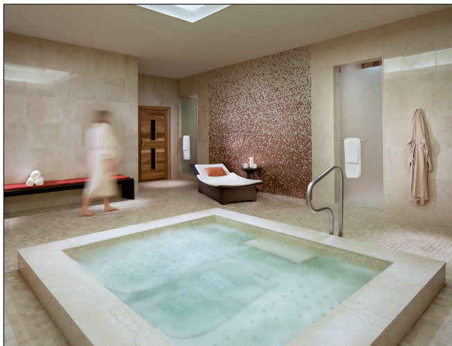
The Spa My Blend by Clarins at The Ritz-Carlton Hotel in Toronto.

The Spa My Blend by Clarins in Toronto offers a one-of-a-kind spa oasis in the heart of Toronto's downtown, surrounded by the incomparable service one expects from The Ritz-Carlton. The natural light of the glass-enclosed fifth floor retreat offers sweeping views of Toronto. Following a treatment in one of the sixteen beautifully appointed treatment rooms, clients can unwind in the dedicated men's and women's relaxation lounges, or in the co-ed Urban Sanctuary sunroom.