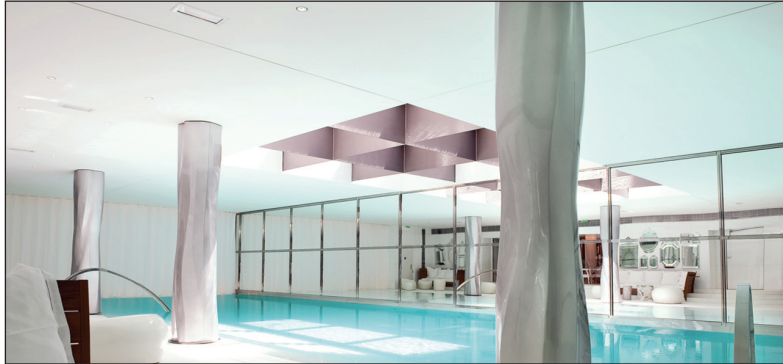
The Spa My Blend by Clarins where they offer facials, body treatments, including the high-definition, customized My Blend facial protocol.

Designed by Philippe Stark in an ethereal lightness of white and blue, the Spa My Blend by Clarins includes a 26-meter swimming pool bathed in natural light, seven treatment rooms, a VIP double treatment room, and ladies and gentlemen's areas, each featuring a sauna, Turkish bath, laconium, shower experience, and ice fountain.