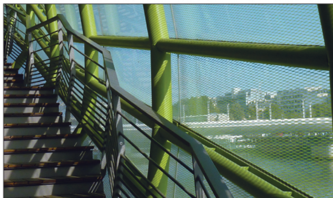
Staircase behind the IFM's green façade on the quai d'Austerlitz