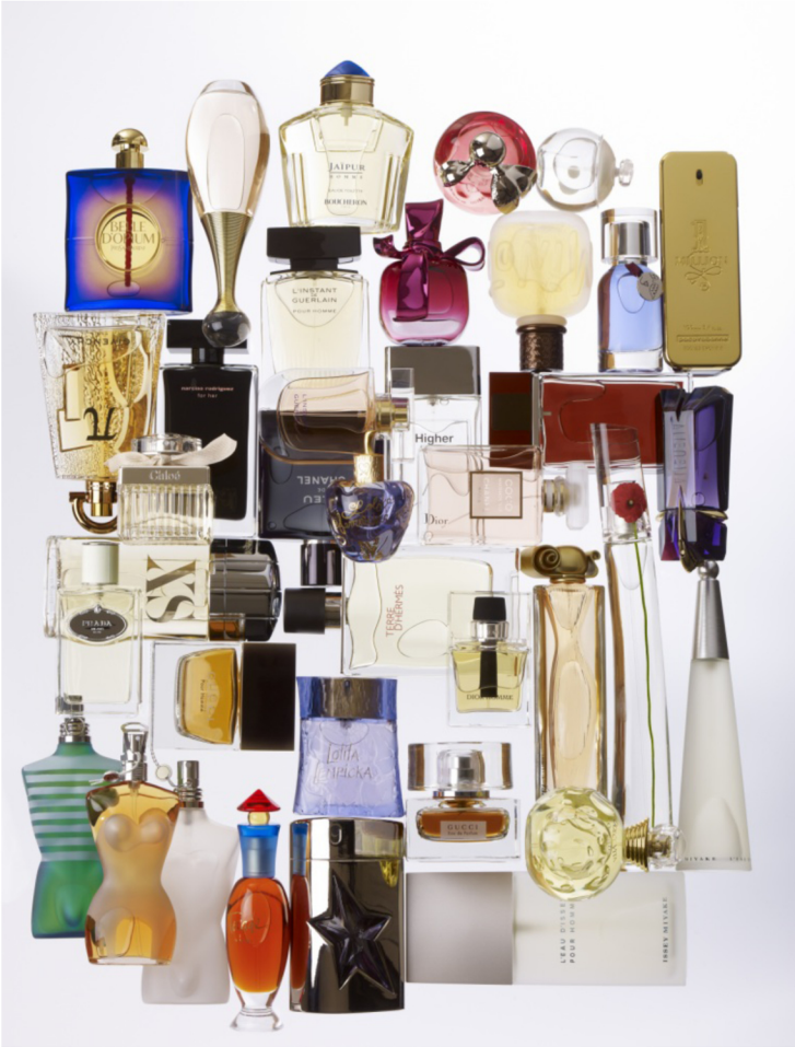
Perfume Bottles 'Best Feminine' and 'Best Masculine' Fragrance Fifi Winners 1992-2011